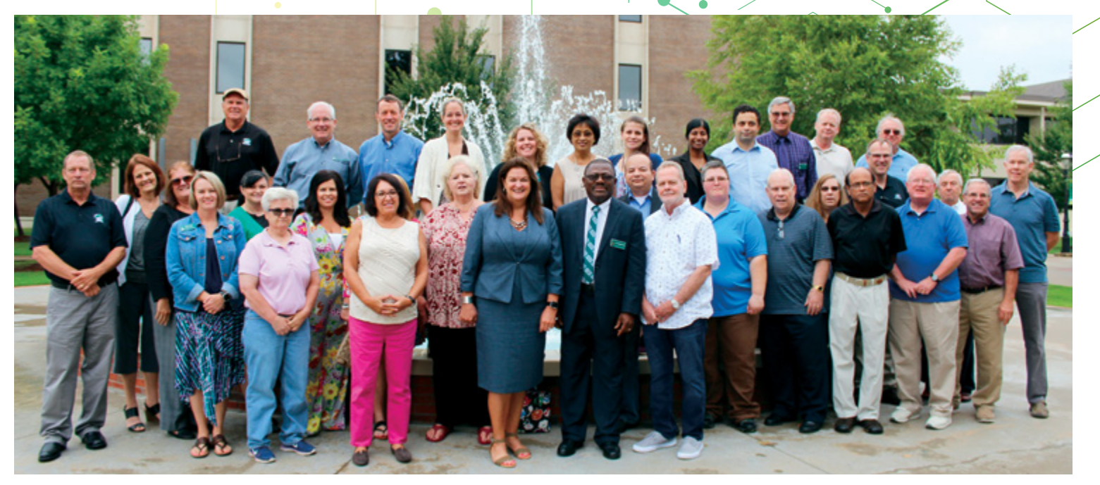
NSU College of Business & Technology Faculty and Staff 2018/2019